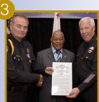
Airport Police Awards