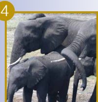
My Best Shot